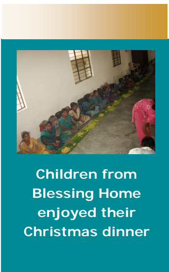
Children from Blessing Home enjoyed their Christmas dinner