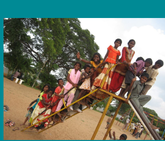
Blessing Home children during their trip to Kallanai