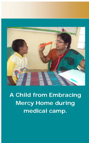
A Child from Embracing Mercy Home during medical camp.