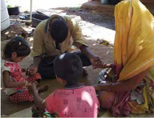
Thousands of Families throughout India are a part of Operation HOPE—Houses of Prayer Everywhere.